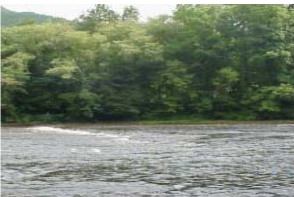
Hiawassee River Ranger—Naturalist Hiawassee State Scenic River Box 225 Delano, TN 37325

Located in eastern Tennessee, the Hiawassee River is one of the top scenic rivers in the state. The river has mostly Class I ( calm flat water ) and Class II ( easy rapids, some maneuvering necessary ), but a few Class III rapids ( difficult, some complex maneuvering, scouting is advised ) provide an excellent challenge. The Hiawassee is an excellent river to learn and practice basic kayaking and canoeing skills. Middle Tennessee Council has equipment that troops can check out for trips on the Hiawassee. As always, safety should be a primary concern. At least one of the adult leaders should be familiar with the river prior to a troop outing, and everyone on the trip should scout difficult rapids. The Tennessee Scenic Rivers Association offers instructional programs for Scouts and adult leaders; at least some of the adult leaders should be certified in whitewater safety and rescue.